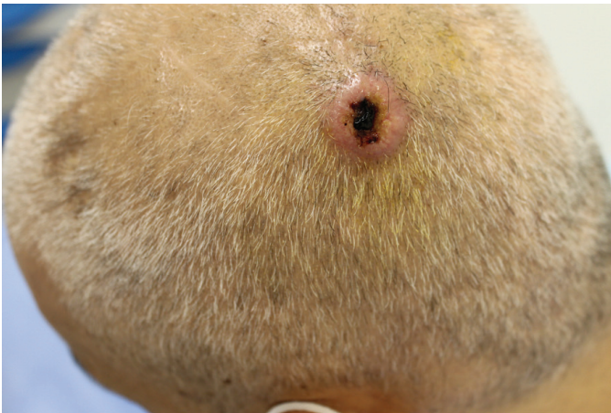
Figure 1. A 52-year-old male patient applied to our clinic because of a hard mass on the scalp. It was learned that the patient had been in follow-up for two years for colorectal adenocarcinoma in the oncology clinic and was undergoing chemotherapy treatment after the surgical operation.

An examination of his scalp revealed a solitary, hard, infiltrated, hemorrhagic erythematous nodule with hemorrhagic crust in the middle with a diameter of about 1 cm.